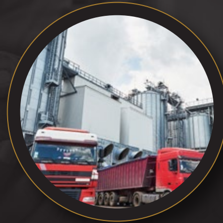
Proposed Cement Factory Production