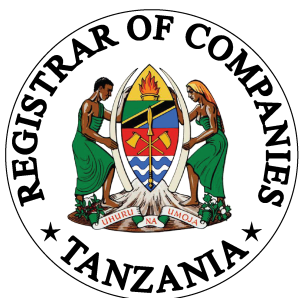
PRINC ASST. REGISTRAR OF COMPANIES

GIVEN under my hand at Dar es Salaam this 9 th day of AUGUST TWO THOUSAND AND TWENTY FOUR.