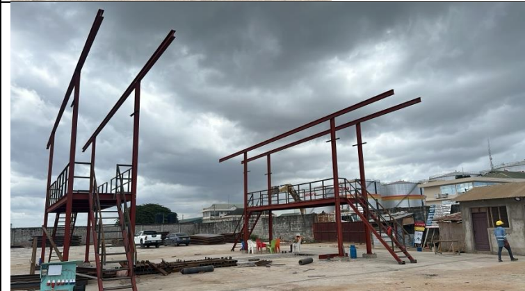
erection of gantry works