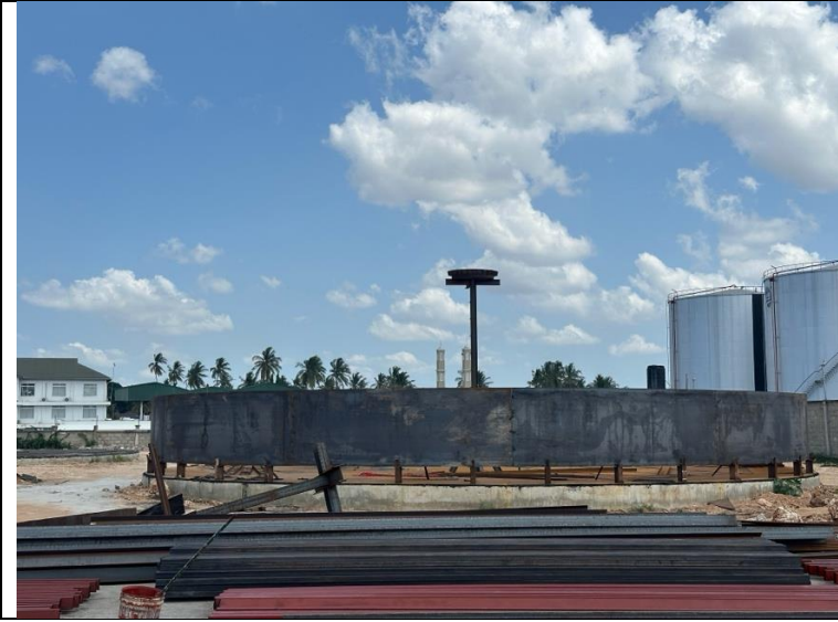
erection of tank works