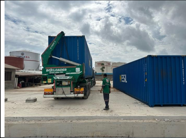
importation and delivery of steel materials