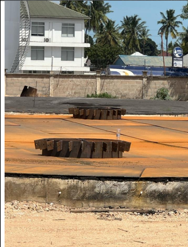
bottom plates for tanks