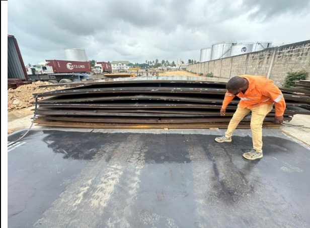
materials inspection and offloading