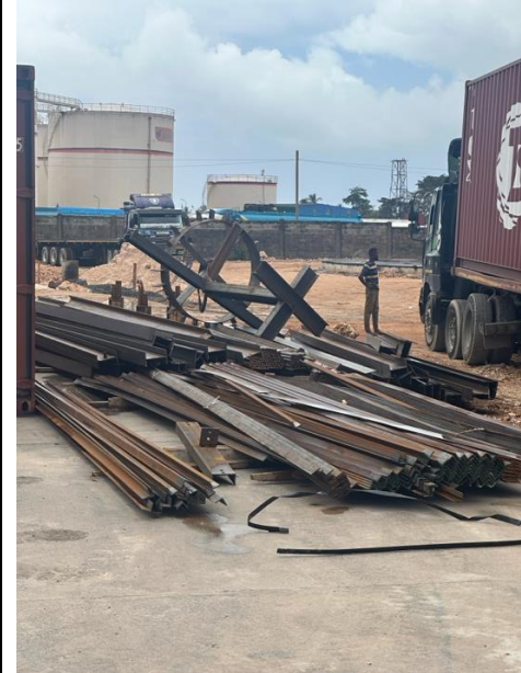
pre-fabrication of roof works for tanks