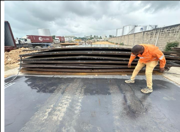
materials inspection and offloading