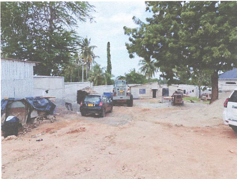
Construction of New office and trucks yard on Plot No P38066 and Plot No 81/1 Block C Kunduchi Mtongani area, Kinondoni Municipal Dar es salaam.