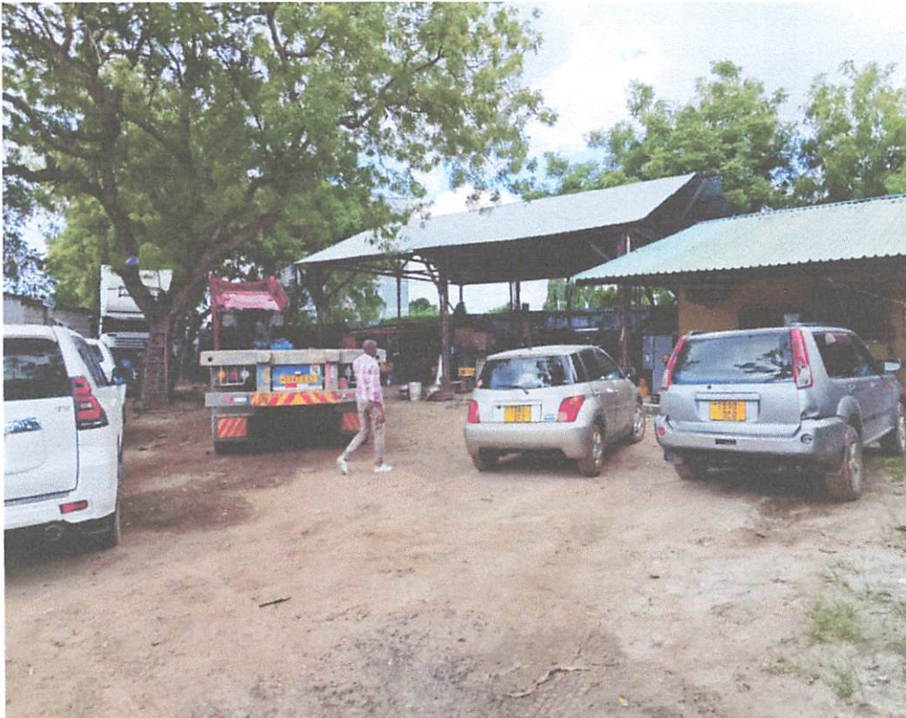
Office and Garage site