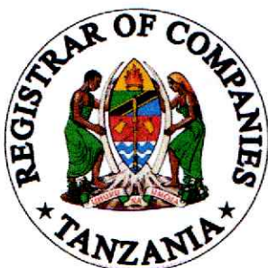
PRINC ASST. REGISTRAR OF COMPANIES

GIVEN under my hand at Dar es Salaam this 14 th day of FEBRUARY TWO THOUSAND AND TWENTY FOUR.