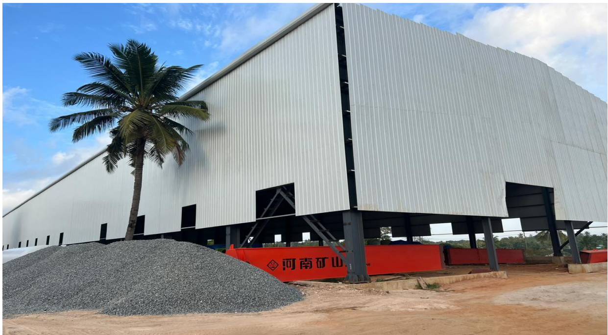
2. Tank Factory