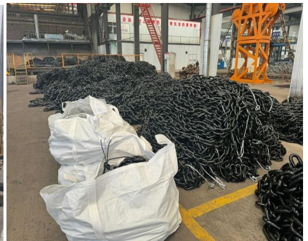
CBM Construction materials