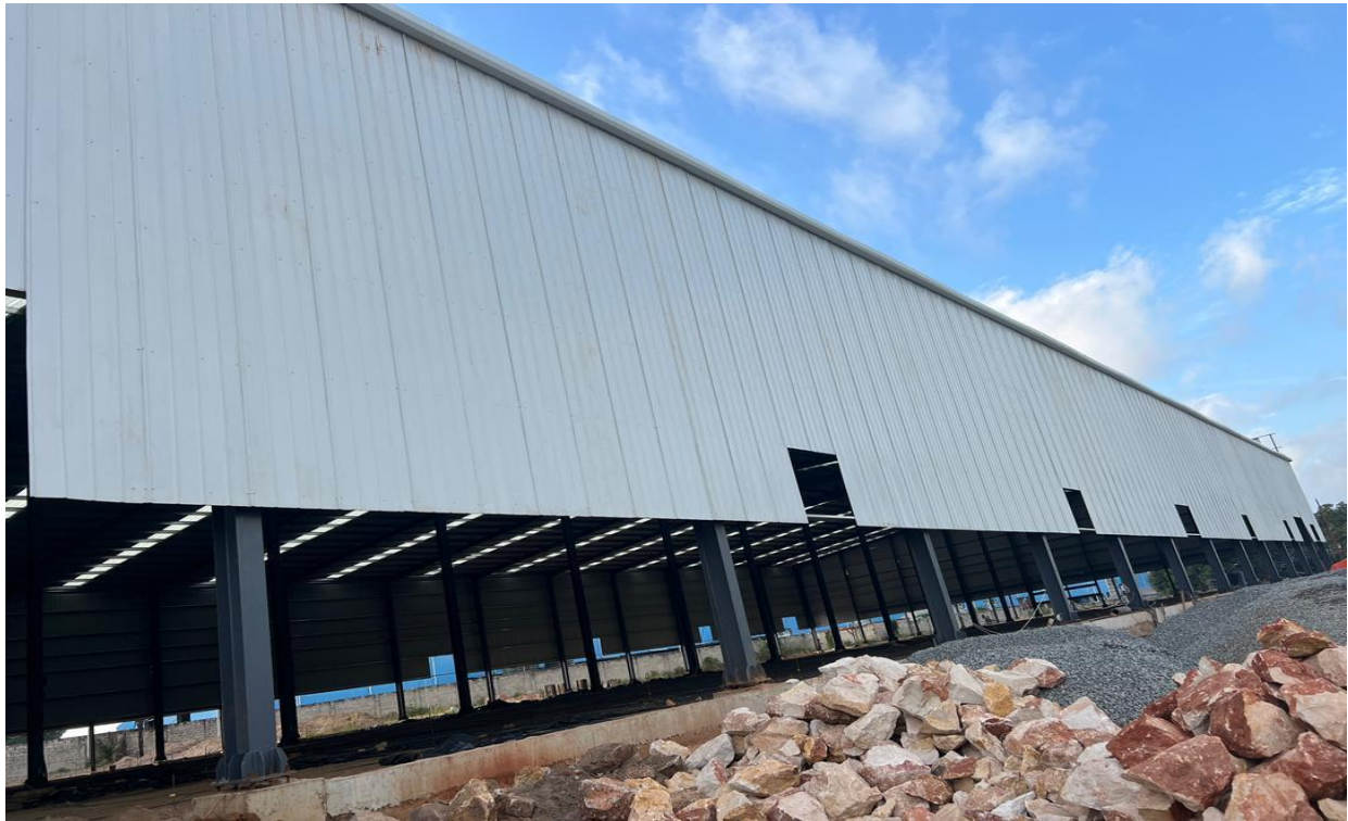
1 . Cylinder Factory