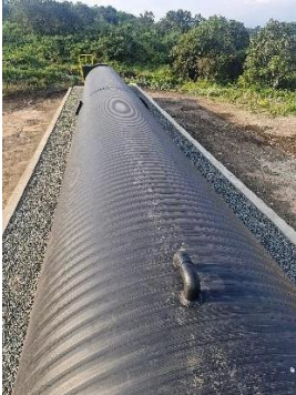
Main water tank at CEA farm

Network establishment ongoing to the Production sites and Hatchery