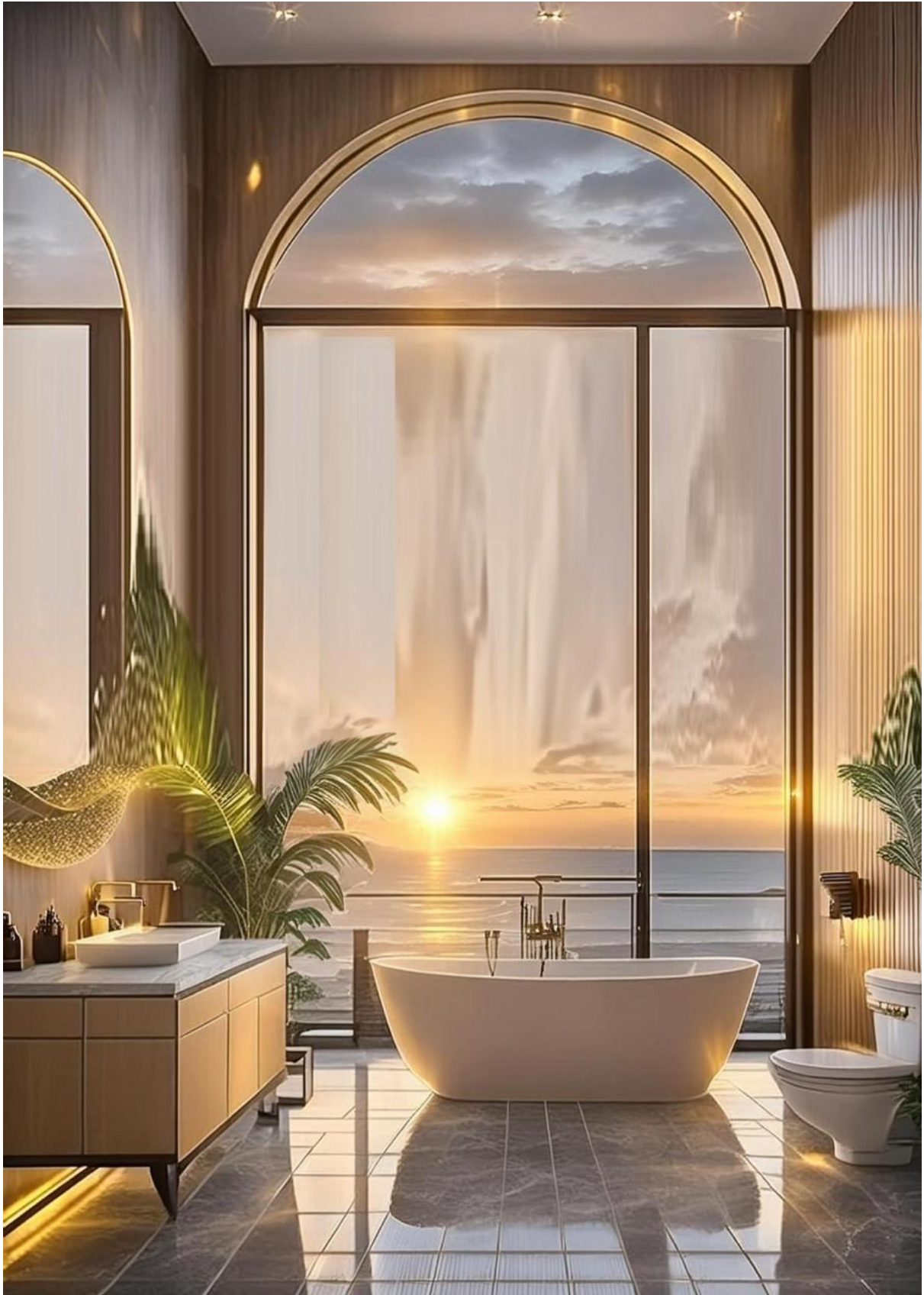
Marble cladded Bathroom with Lavish Interiors