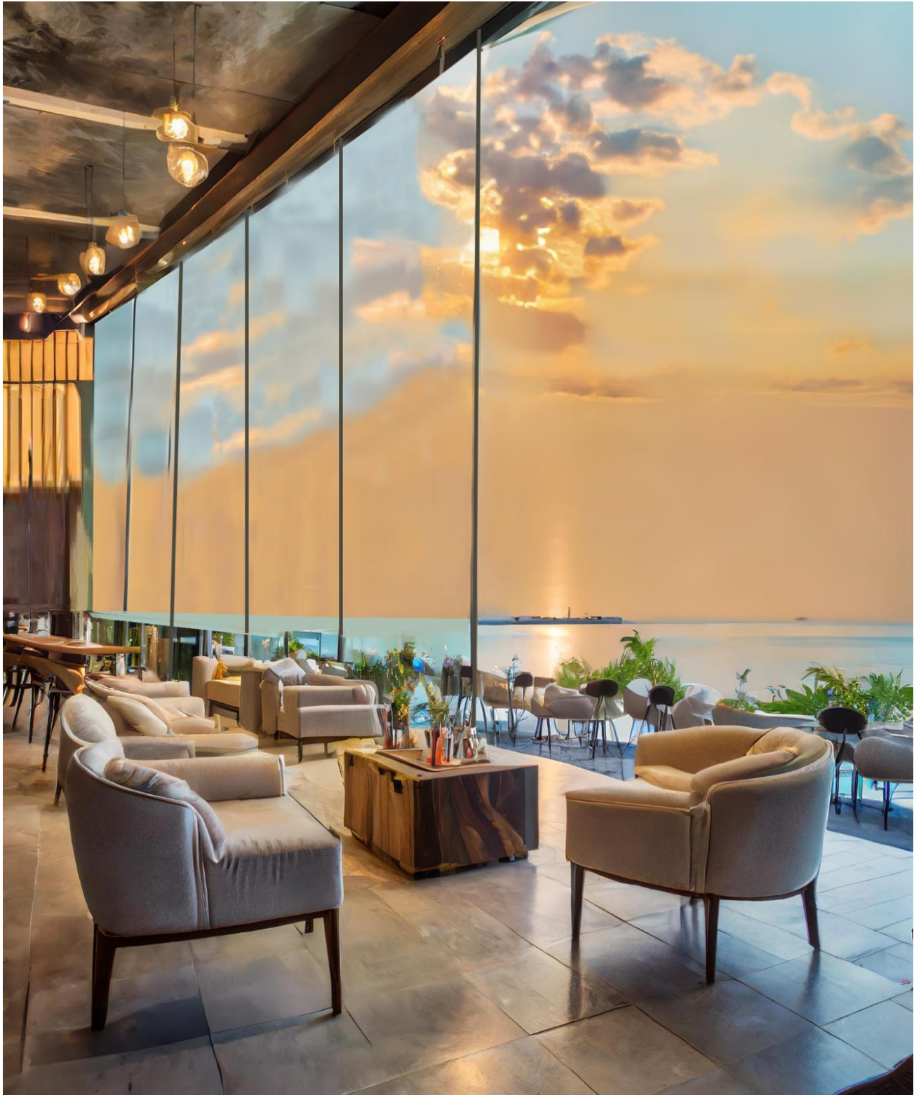
Elegant Sitting at Sky Bar providing soothing ambiance with the fresh breeze from the Indian Ocean