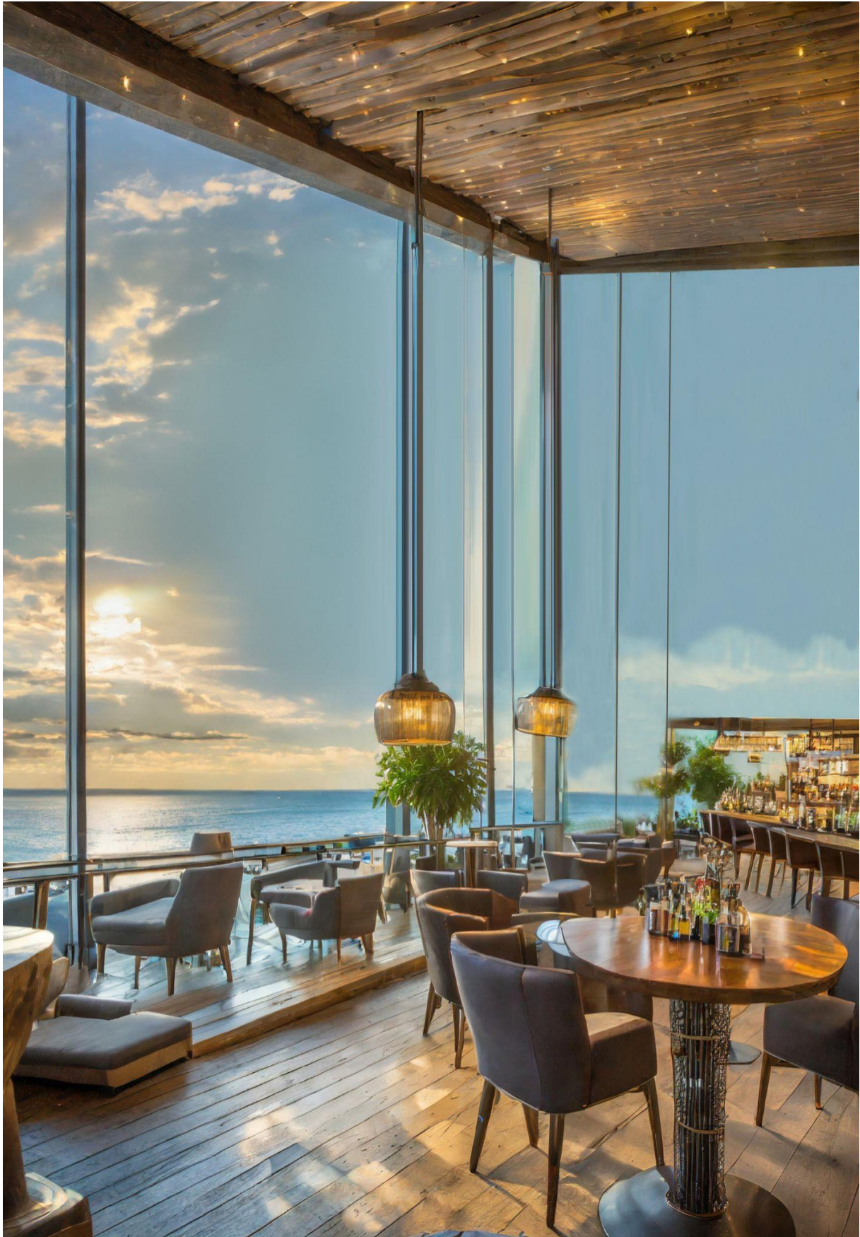
Indoor Bar area of the Sky Bar.