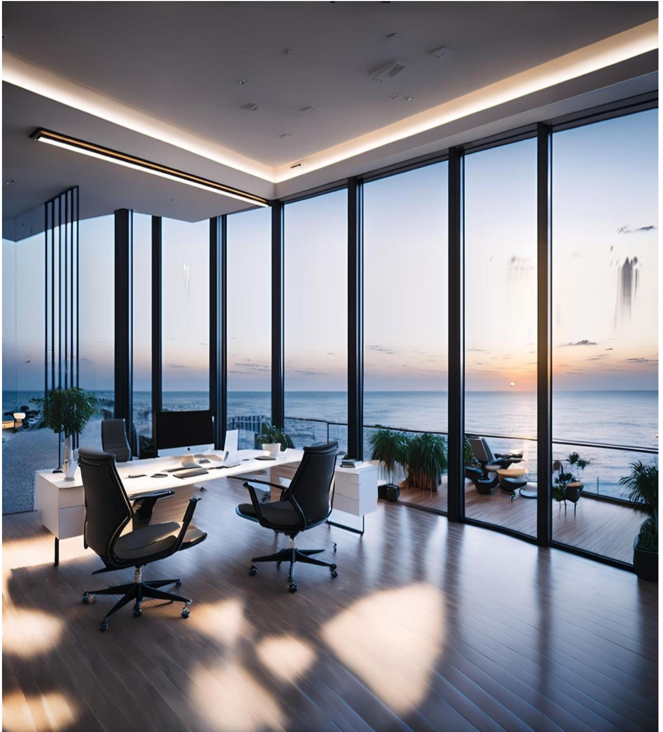
Inner Office proposed meeting room setting overlooking Indian Ocean Sea View.