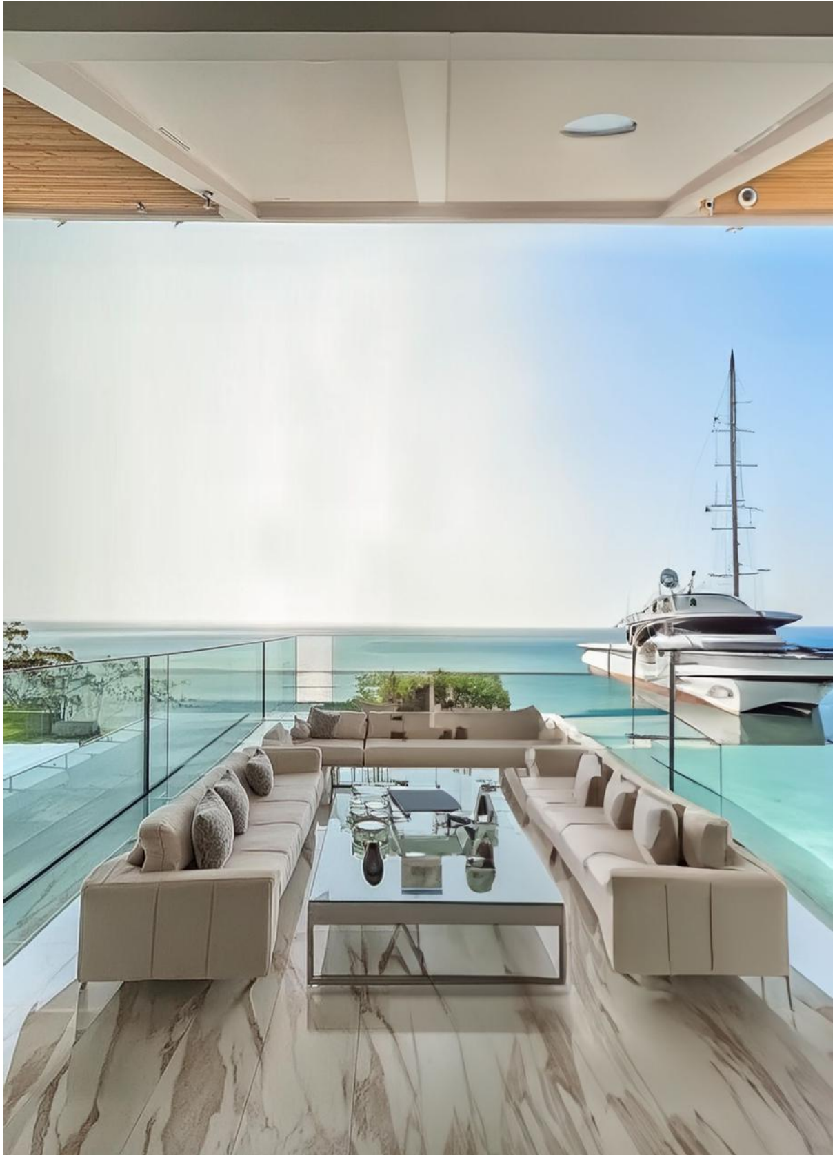
Spacious Balcony with be-spoke outdoor seating overlooking Breath taking Indian Ocean View.