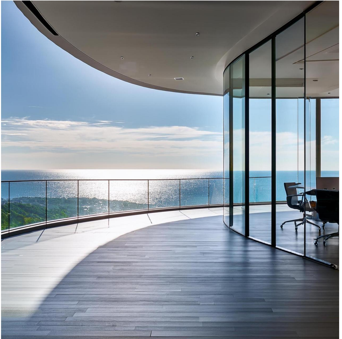
Sea View Facing Balcony with outdoor seating for Meetings