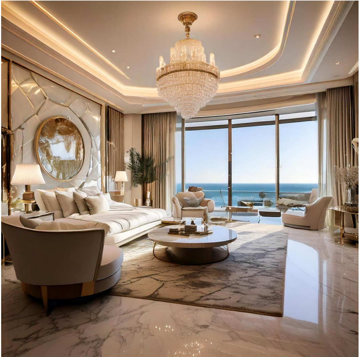
Ultra Luxurious and spacious Master Bedroom overlooking Indian Ocean