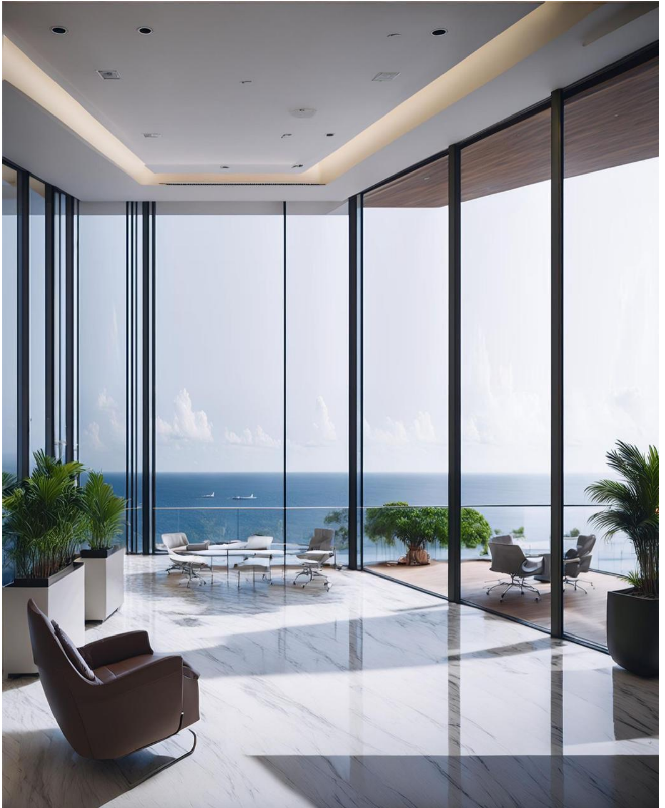
Sea View Facing Balcony with outdoor seating for Meetings.