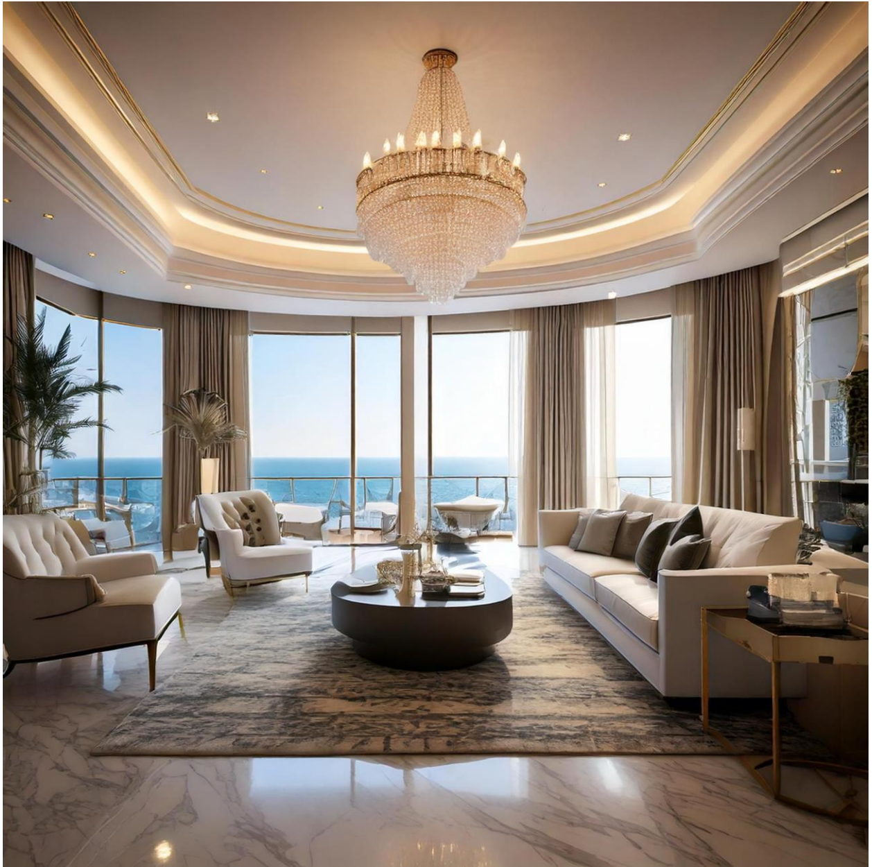
Contemporary style Exclusive Living Room overlooking Indian Ocean