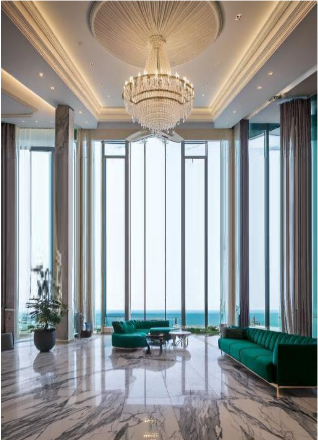
Double Height Ceiling with Italian Hand-picked Marble Cladded Flooring for the HOTEL LOBBY