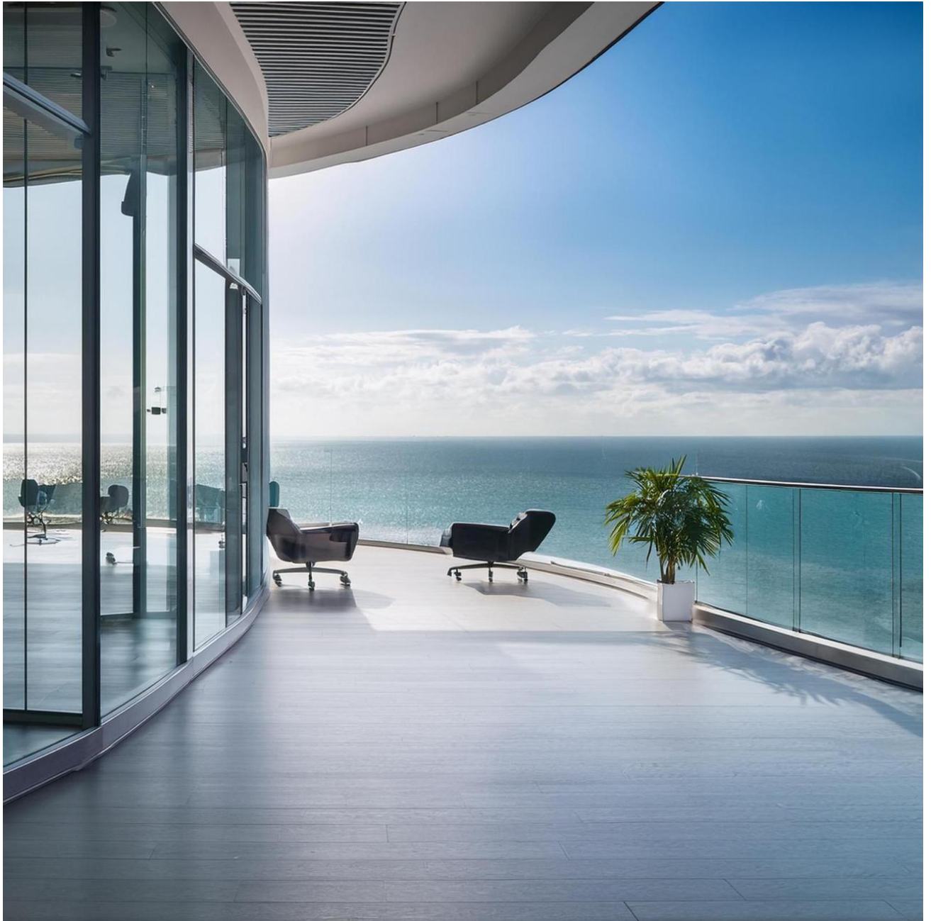
Sea View Facing Balcony with outdoor seating for Meetings.