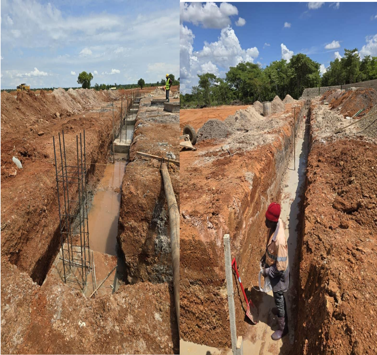
FOUNDATION WORK FOR THE WAREHOUSES

THE FOLLOWING ARE THE PICTURE OF ASK ENGINEERING PROJECT