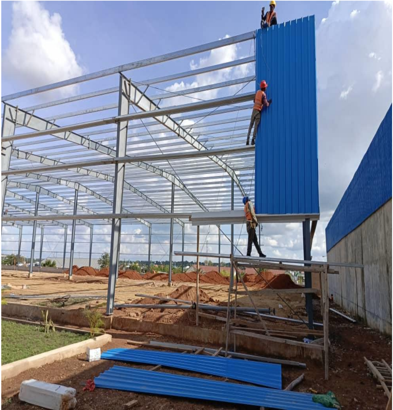
COVERING OF THE ERECTED STRUCTURE