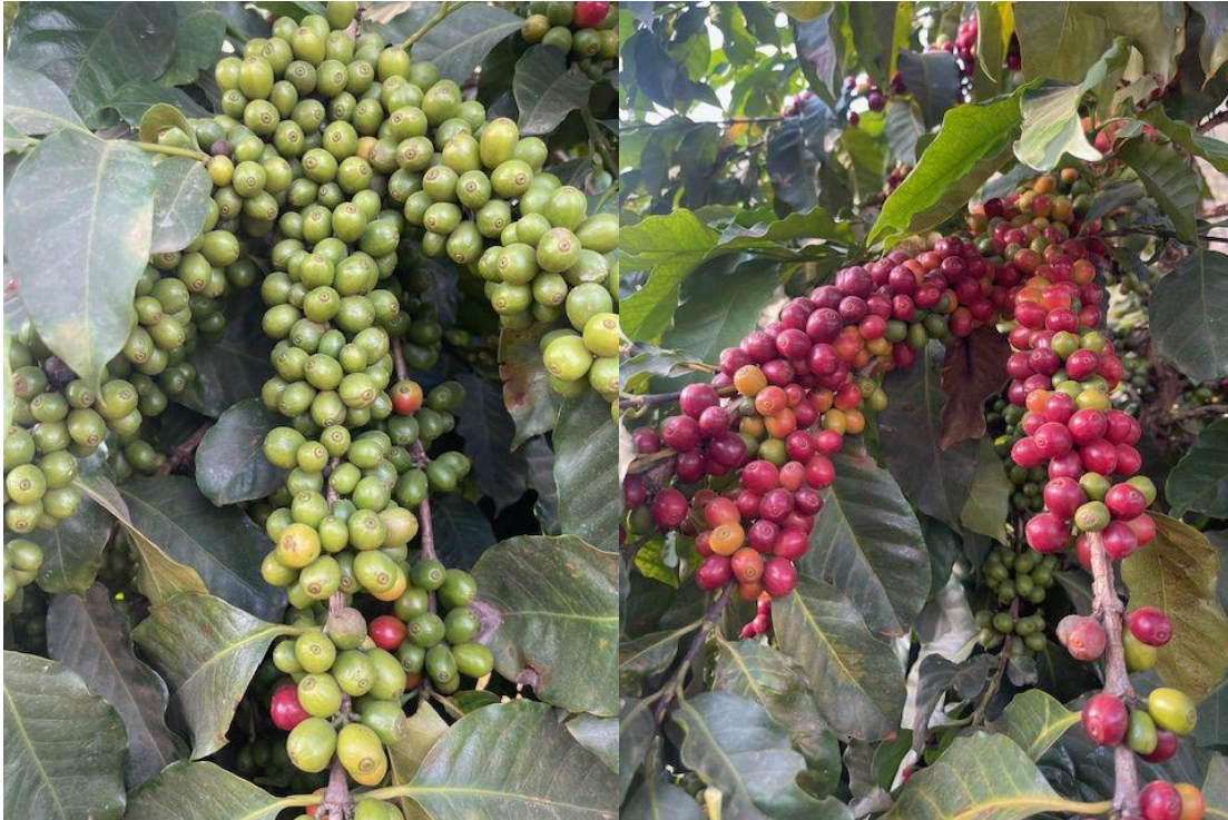
Heavy cropping – green and mature cherry