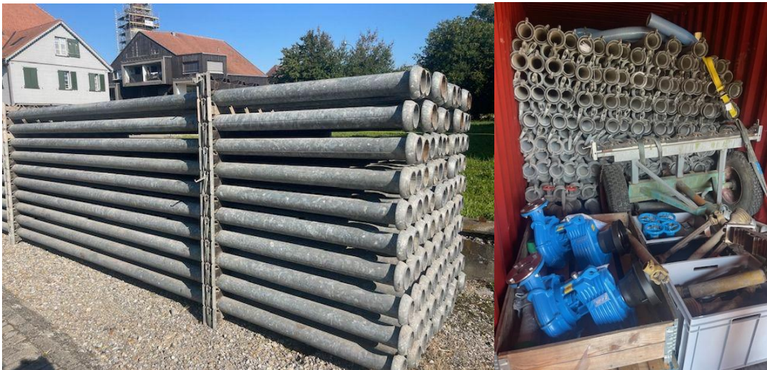
4-inch galvanized Perrot pipes and equipment in import container