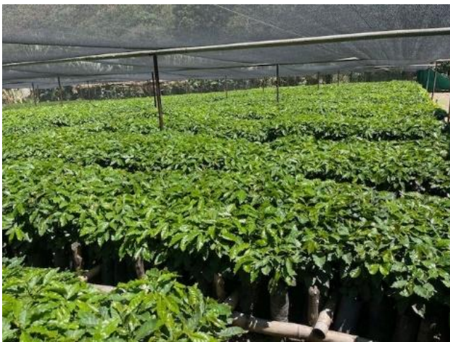
Modern nursery with 33'500 plants for planting 2025