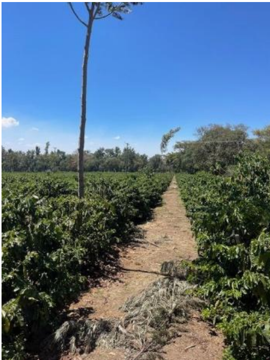
High-productivity field planting December 2023