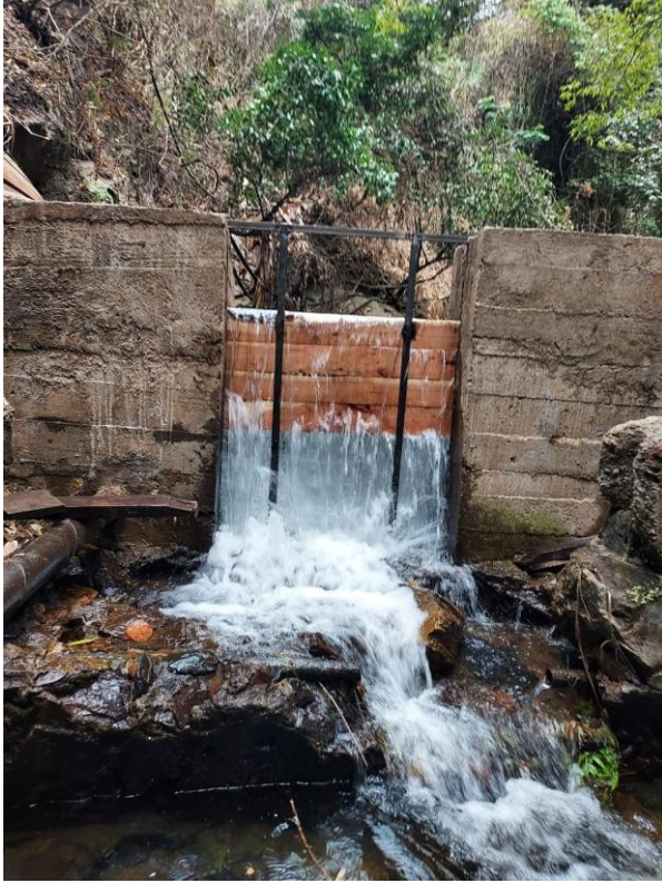
New water dam