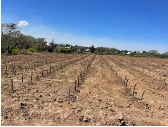
Preparation for high-density planting