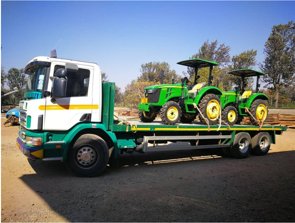
New tractors arriving on Utengule