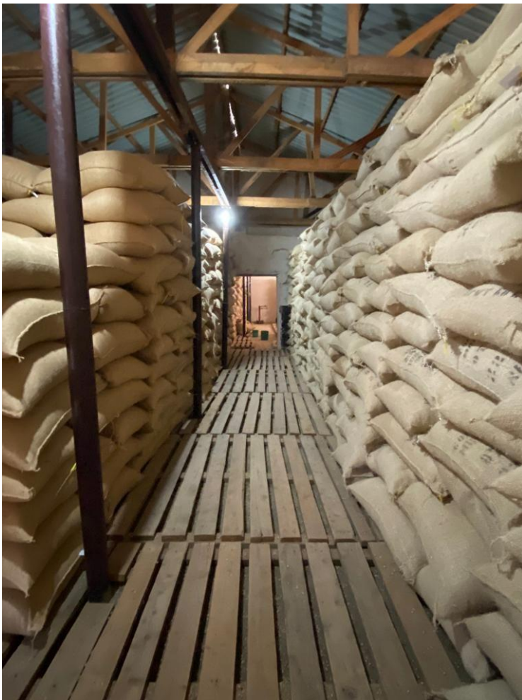
New coffee warehouse