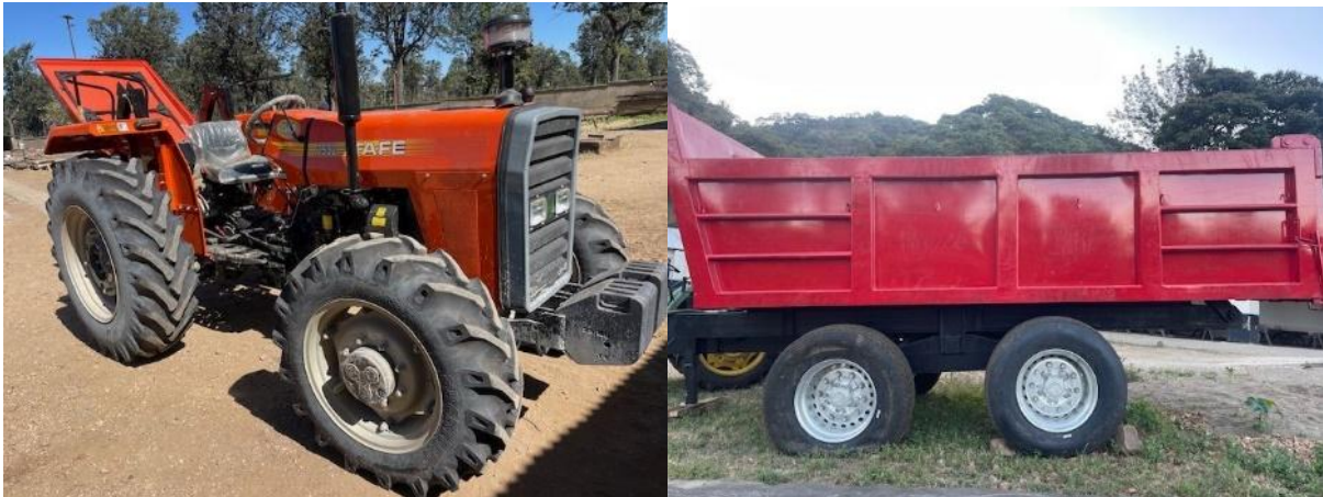
New tractor and trailer