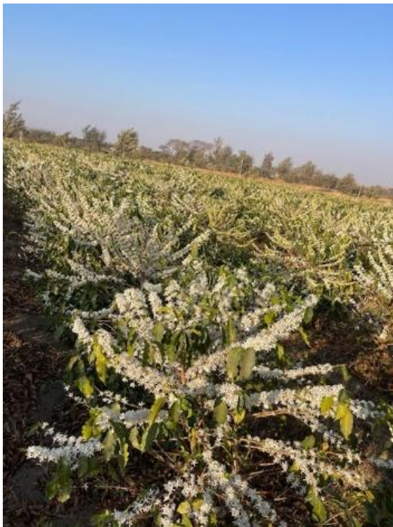
Strong flowering in new generation coffee field