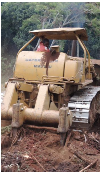
Soil ripping with bulldozer